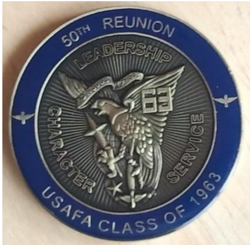
This photo published in the Web version.