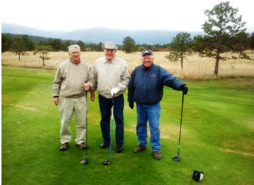
Testing Butch's Swing

Again, many thanks to Jimmie Butler for the picture of our fallen Classmates from the SEA Conflict.