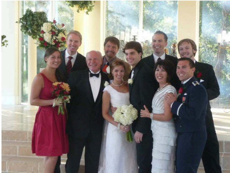
The Heimburger Family