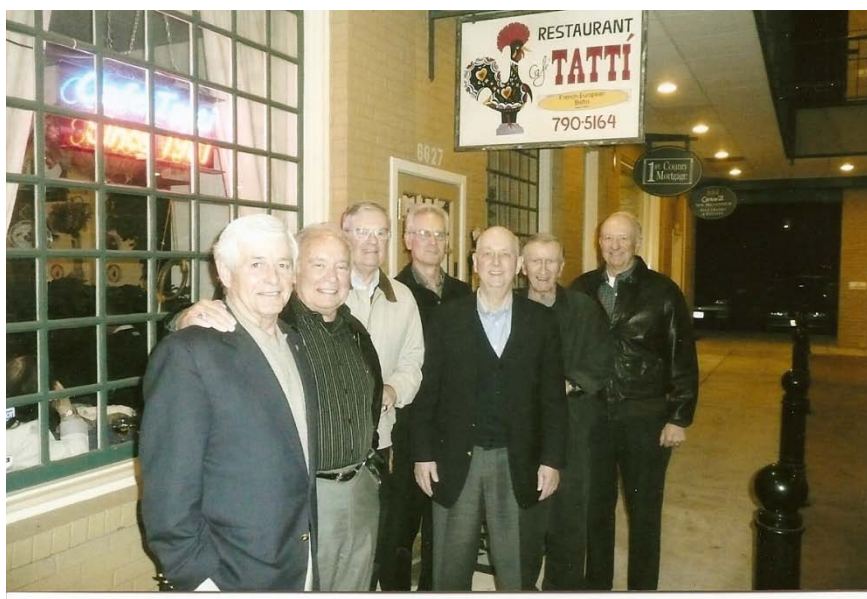
DC Golden Boys out to dinner last November