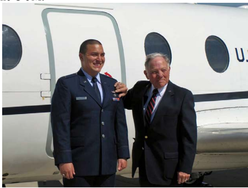
New wings from Gramps.

Gil Merkle added a short note with a little more information about class participation for our 50<sup>th</sup> year activities: "In addition to written biographies and photos, we have collected 417 short video clips from classmates. The videos totaled 2,905 minutes or 48.4 hours of recorded personal stories that were collected by classmates and placed onto the class histories website at <a href="https://www.usafaclasshistories.org">www.usafaclasshistories.org</a>. These videos were recorded and collected during